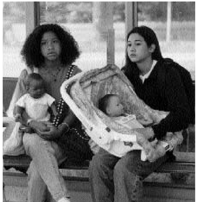
Send out the Parent Evaluation shortly after the students' parenting simulations end. Most parents offer excellent suggestions and usually show a great deal of support for the Program.

The expense worksheet is a basic for the Program at all age levels, but you will need to determine which options best fit the learning level of your students. How they find the prices may vary. Are they required to shop in certain stores? Are catalogs allowed? May they use personal ads from newspapers to purchase used cribs? If you have several Babies, you may want to require students to report for a specified time at a local mall for a shopping trip. If so, you may choose not to give them the expense worksheet until they