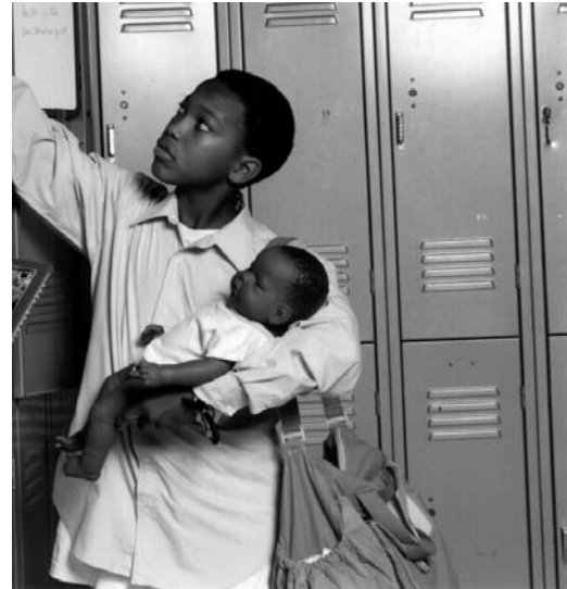
Caring for Baby before going home will give students' confidence in properly supporting Baby's head.