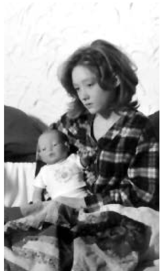
Examine each wristband before the students leave, as wristbands should fit snugly without being too tight