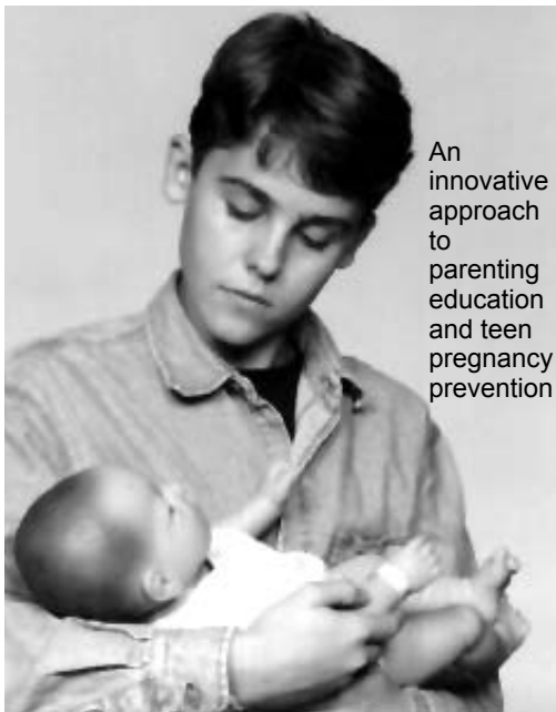
An innovative approach to parenting education and teen pregnancy prevention

The superintendent, school board members, and principal are usually excited about new, innovative approaches to parenting education and teen pregnancy prevention.